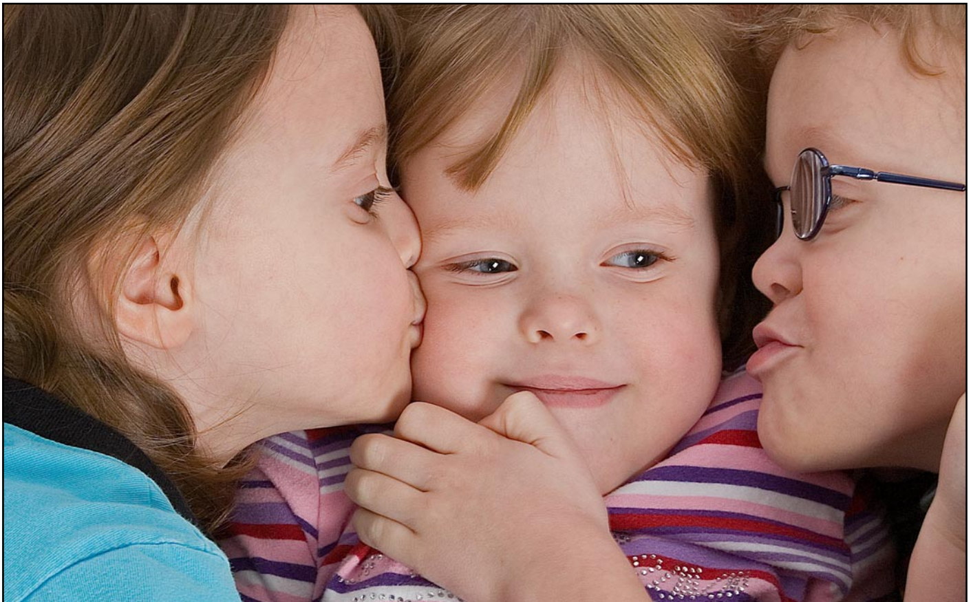
The Ohman Triplets