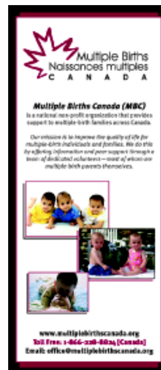
(NEW Bilingual PR Pamphlet)